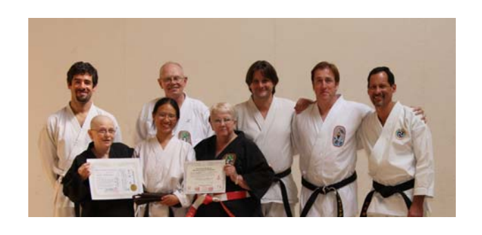
The OKU Heads West