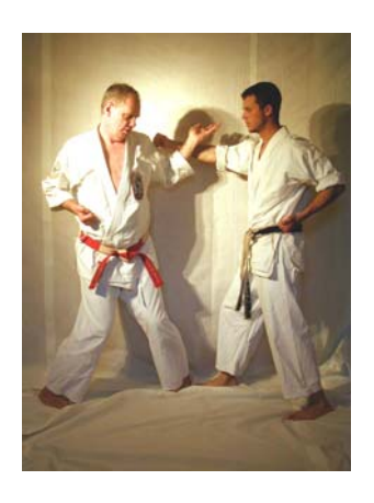
The Magic of Kata